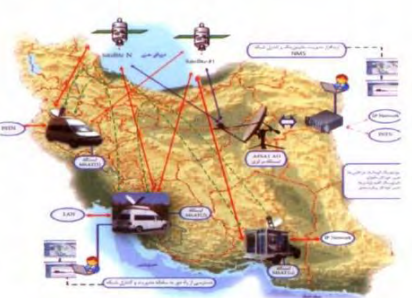
شبکه ماهواره ای سیار (شمس)

SHAMS system can be consists of unlimited number of fixed and mobile antennas like MSAT-120 Antenna (mounted over Vehicles), and a AFSAT-AD Antenna in H.Q as HUB. Finally NMS software will manage whole network parameters like bandwidth, output power,... & control the Auto-deploy Antennas orientation remotely.